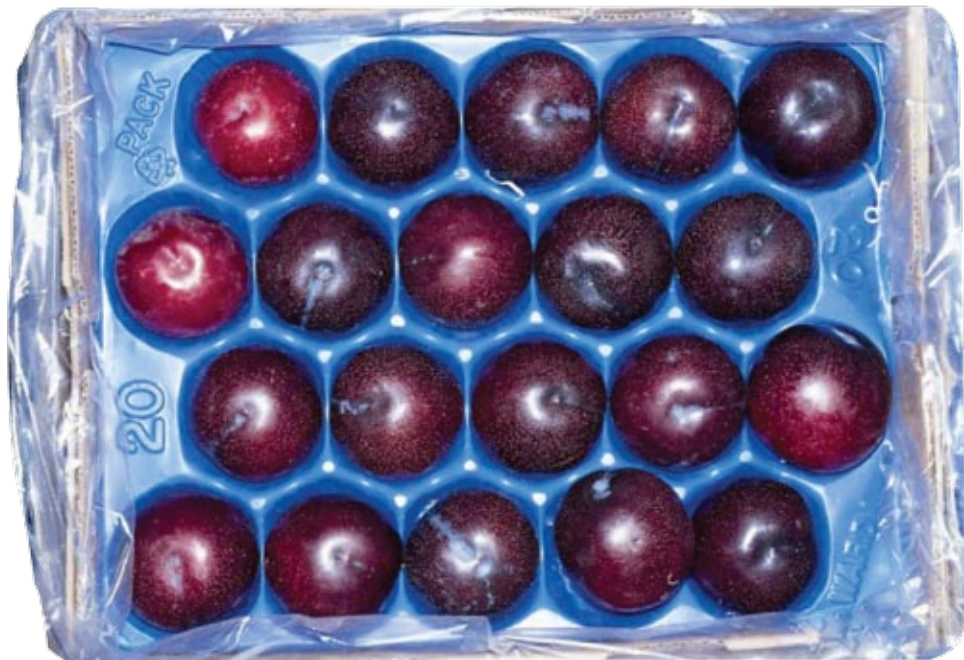
■ Proper packaging for plums of Class Extra and I