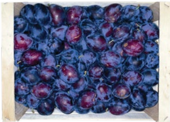
■ Packaging of plums in wooden box Class II