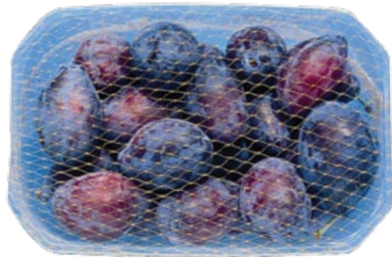
■ Small package